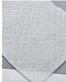
Embossed Big Squares