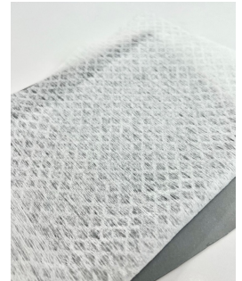
Embossed Small Squares