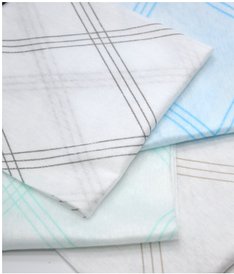
Big Squares Dyeing